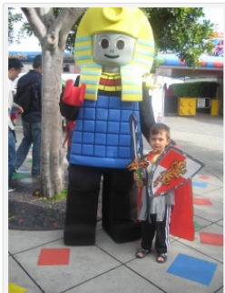
Our little knight was ready for the stroller after a couple of fun-filled hours at Legoland

After a day of rides, including several rounds on my son's favorite, the Coastersaurus, we found our energy waning, evidenced by my son's willingness to ride in a stroller and even to sit for a caricature of himself as Aang, the Last Airbender. We even snuck in a bit of shopping, picking up a souvenir knight's costume, complete with cape and foam sword, which my son wore the rest of the day. Luckily everyone was ready to go just as the park was closing down at 5 pm.