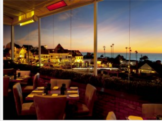
The Pacifica Breeze Cafe at night is a site worth coming back for at sunset

most of it. No wonder the café offers the sugar-spiced salmon in so many dishes — for breakfast in hash and also in a lunch wrap with slaw and a sandwich on a torta roll with lemon mayo.