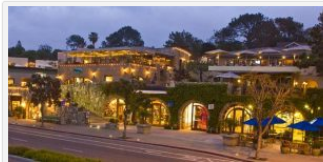
The Plaza Del Mar, on the Camino Del Mar strip, the hub of Del Mar

We'd heard about Del Mar in the radio commercials for the race track, "Where the turf meets the surf," which was an intriguing proposition. The horses weren't yet in town for the races, but we found there was plenty more to do in this adorable seaside village just a 90-minute drive from LA.