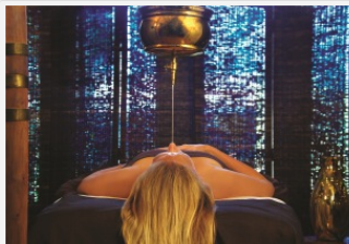
Place 360 offers a full range of health, beauty and relaxation treatments