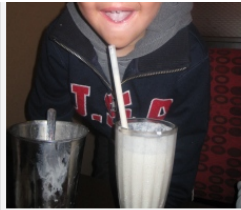
Mixologist in the making at Smashburger

would expect and more from a major regional fair of a major Southern California county. Of course there was traditional fair food of Kettle Corn, cotton candy, bockwurst on a bun, and also the beer gardens, where you could get a draft of just about every kind of brew, but patrons could also enjoy casual or gourmet meals and table service at cafes on the fairgrounds or in the track's famed Turf Club.