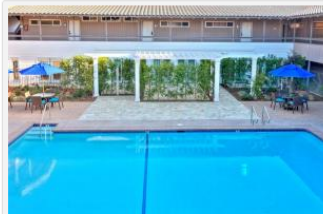
My son's favorite place to hang out at Stratford Inn (soon to be Hotel Indigo)

( www.delmarmainstreet.com ) that it was the first hotel in town, built in 1910, and it was once a magnet for Hollywood silent film stars. Despite the work in progress, it was easy to see the allure of the place, and I can only image how fabulous it will be when the remodel is complete.