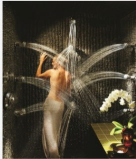
The shower at Place 360 health spa, made of all-imported stones from Bali

( www.place360healthspa.com ) for a massage. From a small seaside town I was transported to Bali. I could see the influence everywhere – Balinese woodcarvings decorating the walls, a hand-carved bench in the quiet room, a shower tiled completely in stones imported from Bali – an aesthetic and spiritual inspiration that immediately puts one in a mode for rejuvenation.