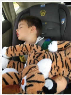
'Night sweet Knight

After taking in all the junk food and excitement we could handle in one afternoon, we headed back to LA. The ride home was particularly quiet as my sunkist and exhausted son snoozed away in the car, clutching his new plush tiger pal. He slept the entire way home, and then through the night. As every parent knows, this is a sign of a truly great vacation.