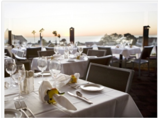
Pacifica Breeze Cafe outdoor cafe adjoins an indoor dining room with beautiful sunset vistas

We also ordered grilled lamb gyro, which was highly recommended by another customer at the counter. It was messy, as gyros often are, but the lamb was tender and juicy and soaked the pita bread, which was dripping with tangy tzatziki sauce, crisp lettuce and fresh tomatoes. It was truly a hot mess, down to the last bite.